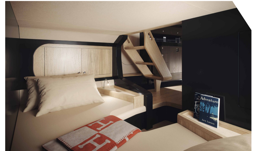
SLR Version Single Aft Cabin

Interior design is created by LIAIGRE - in the yachting industry, the LIAIGRE signature is synonymous with refined materials, assemblies, and finishes.