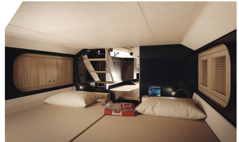
SR Version Twin Aft Cabin